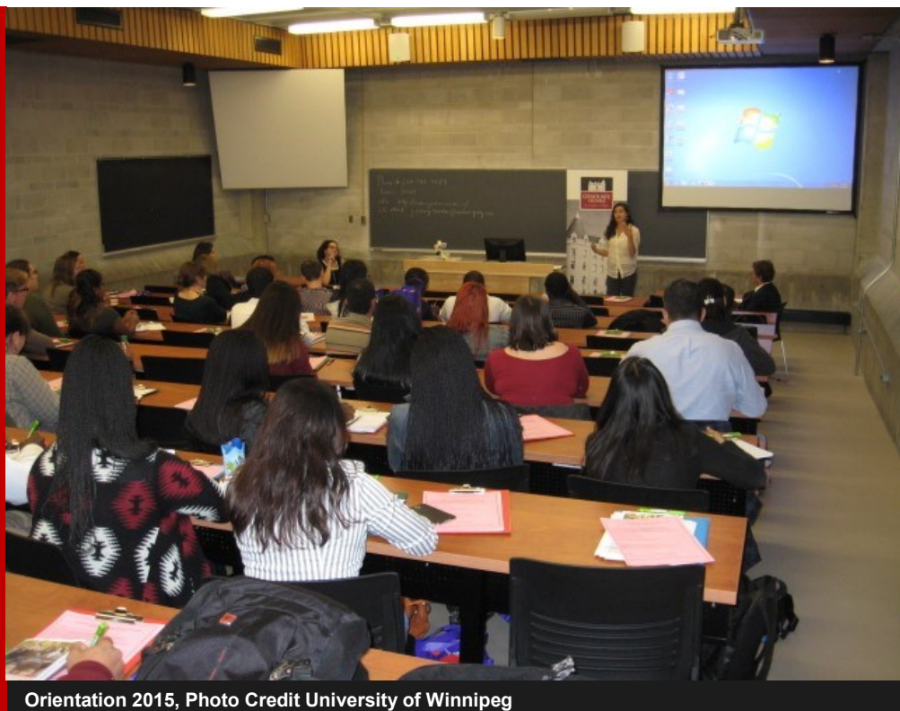
Orientation 2015, Photo Credit University of Winnipeg

January 19— Final Withdrawal Date for Fall-Winter Courses